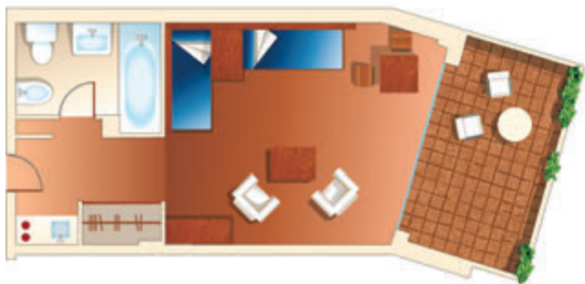
Studio. 2 persons. 33,4 m 2